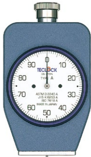
GS-719N Type A Durometer General rubber