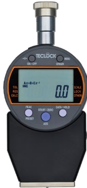
NEW GSD-719K Type A Durometer Digital type With peak detection