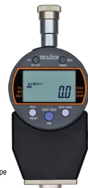
NEW GSD-719K-R Type A Durometer Digital type Stand mounting compatible type Peak pointer type