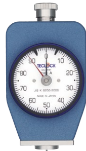
GS-719R Type A Durometer Stand mounting compatible type Peak pointer type